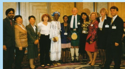
TAFISA World Congress, Chiba, Japan (1993)