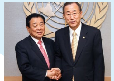
TAFISA President in New York at the UN Headquarters with UN Secretary-General Ban Ki-Moon.