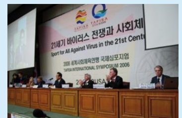
TAFISA International Forum, Busan (2006)