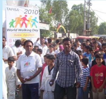
Taking to the Streets of India