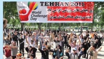
Tehran takes the Challenge

Since 1992 the World Challenge Day is held every year on the last Wednesday in May where communities of similar sizes from different countries are paired against each other in a friendly competition to motivate as many citizens as possible to be physically active for one day. Every year more than 55 million participants from 3.300 communities from 50 countries participate.