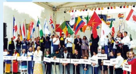
Festival of Traditional Games, Hanover, Germany (2000)