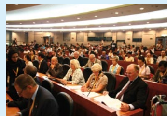
21st TAFISA World Congress, Chinese Taipei (2009)

TAFISA World Congresses have been held around the world every two years since 1991, bringing together world renowned experts, researchers, practitioners and national representatives to present, discuss and share issues in the field of Sport for All and physical activity.