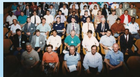
Founding faces of TAFISA, Bordeaux, France (1991)