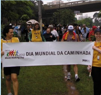
Leading the Way in Brazil

TAFISA launched the World Walking Day in 1991 to promote health through walking. This event is held in October with attracting more than 50 countries and more than 15 million people to participate every year around the world.