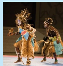
African Tribal Dance

First under the title "Festival of Traditional Games and Sports" the week-long World Sport for All Games held every 4 years offer a unique showcase to discover the rich and diverse traditional and contemporary games, sports and cultures with participating delegations from up to 100 countries.