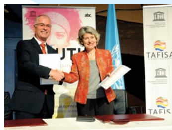
Ms. Irina Bukova, UNESCO Director-General, with TAFISA Secretary General at the Partnership Signing Ceremony.