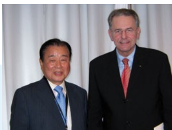
TAFISA President with IOC President, Dr. Jacques Rogge