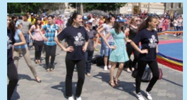
Being physically active in Romania